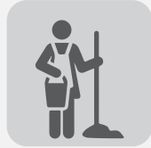
HOUSE KEEPING & JANITORIAL SERVICES