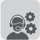
ADMINISTRATIVE & SUPPORT SERVICES